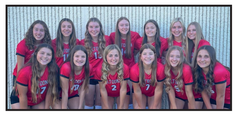
Congratulations to the Altoona High School girl's varsity volleyball team for earning the 2023 USMC/AVCA Team Academic Award, annouced July 13th! View the official AVCA press release here: https://www.avca.org/awards/avca-team-academic-award.html

Co-curricular activities are an essential part of school life for students, promoting a well-rounded education through activities that teach problem-solving, leadership, critical thinking, and communication skills. They also contribute to social and emotional development. Students who participate also engage in community service, which fulfills course requirements and boosts the chances of obtaining a college degree by 22%. Additionally, participating in community service is linked to improved academic performance, increased self-confidence, and the development of valuable soft skills such as networking, problem-solving, and character building.