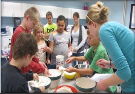
After-School Cooking Club an example of a collaborative effort with the community