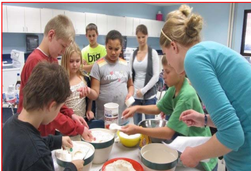
After School Cooking Club—November 15, 2011

"It's where staff go "above and beyond" what's expected."