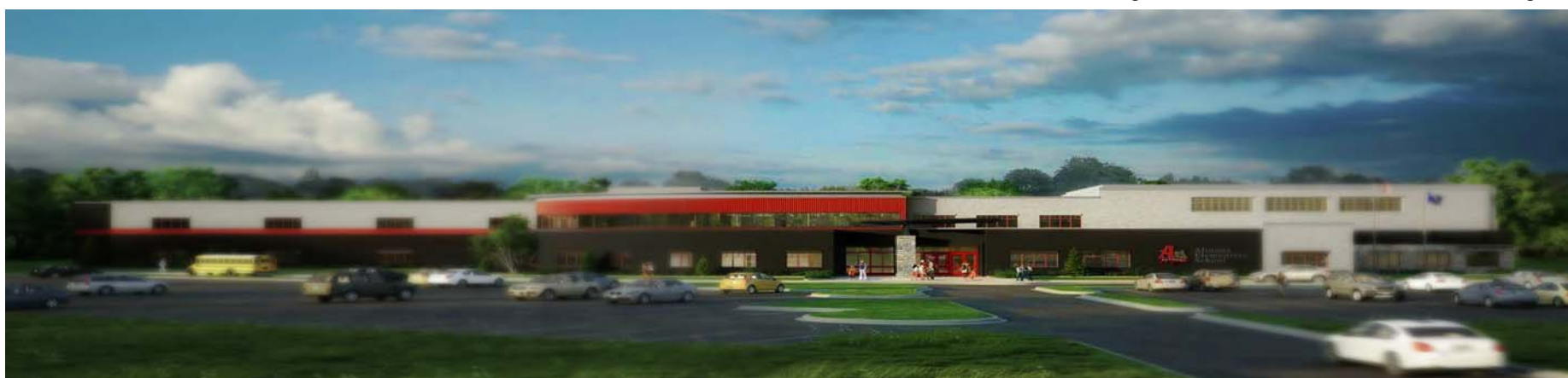
Altoona Elementary School, which will house our K-3 student population, is slated for occupancy at the start of the 2016/17 school year.