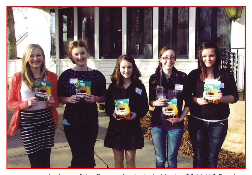
Authors of the five stories included in the 2011/12 Poetica Grandma-tica, a book of, about, and by grandmothers of the Chippewa Valley!

7th grade science students worked on team building skills, cooperation, and creativity while trying to create the longest line possible using their bodies (height), shoelaces, sweatshirts, belts, etc. Following the exercise, the classes challenged themselves in science by looking beyond the box to arrive at a conclusion.